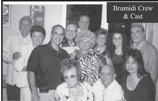
Brumidi Crew & Cast