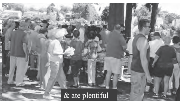
&amp; ate plentiful