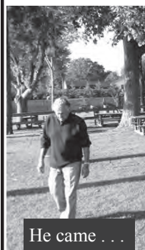
He came . . .