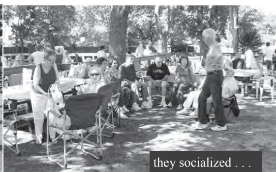
they socialized . . .