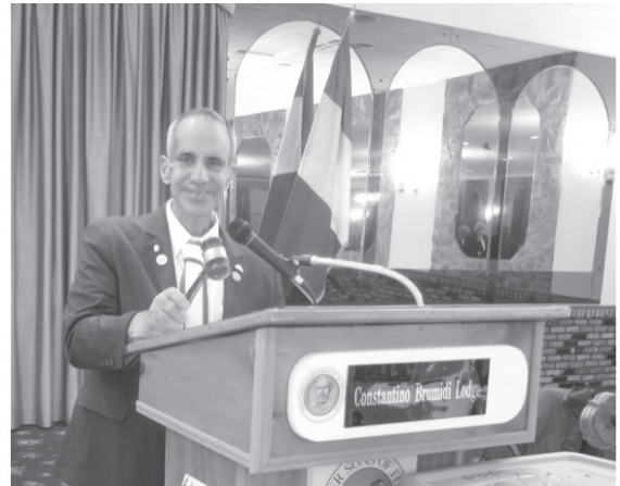
Final rap of the gavel at the podium as Presiding Lodge President. February 16 th , 2021 General Business Meeting