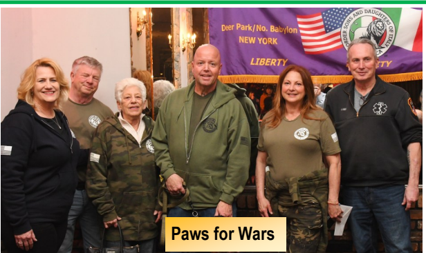
Paws for Wars