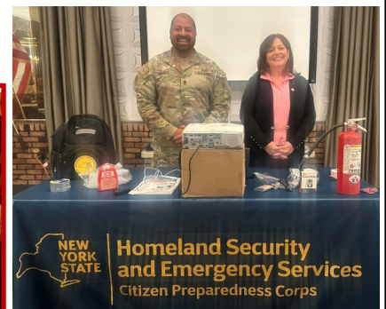
Emergency Services Presentation