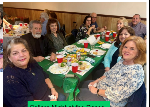
Sellaro Night at the Races