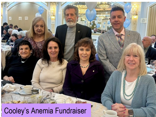
Cooley's Anemia Fundraiser