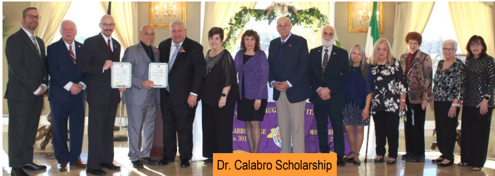
Dr. Calabro Scholarship