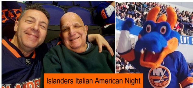
Islanders Italian American Night