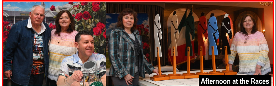
Afternoon at the Races