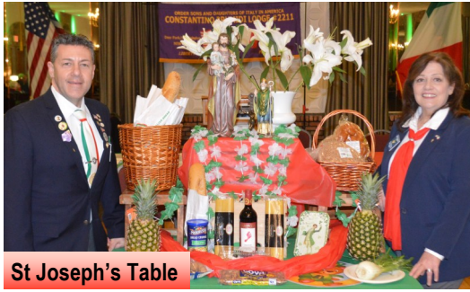
St Joseph's Table