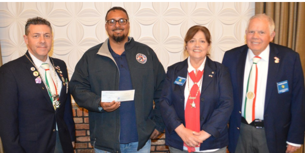
Paws for Wars Donation Presentation