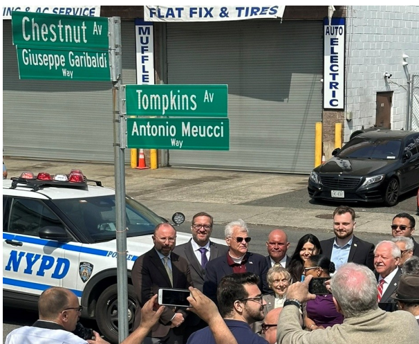
Garibaldi & Meucci Street Dedication Ceremony Chestnut Ave & Tompkins Ave changed to Giuseppe Garibaldi Way and Antonio Meucci Way in Staten Island.