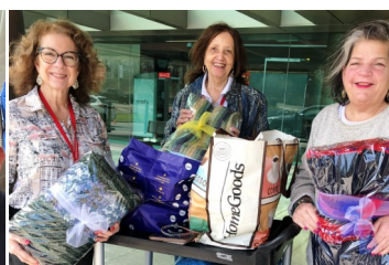
Veteran's Lap Blanket Drop-off