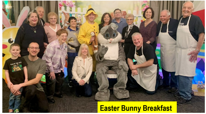
Easter Bunny Breakfast