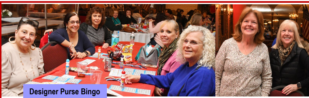
Designer Purse Bingo