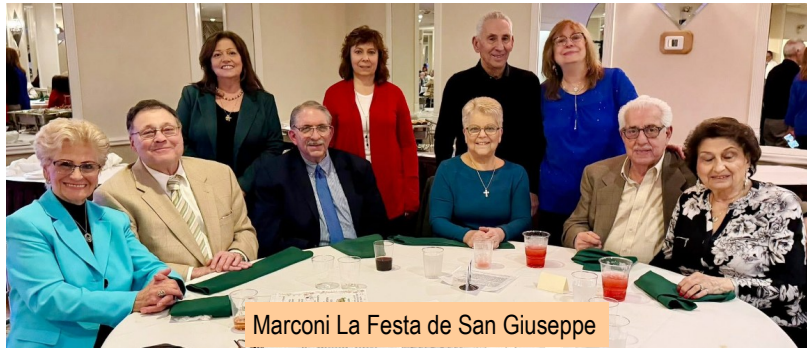
Marconi La Festa de San Giuseppe